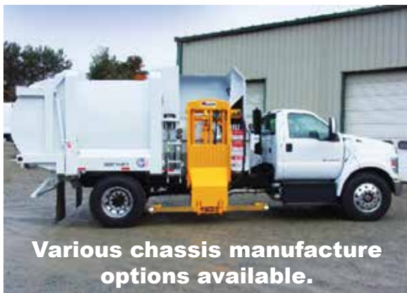
Various chassis manufacture options available.

Light weight Nylatron® bushings replace traditional heavy and more costly steel or bronze bearings.